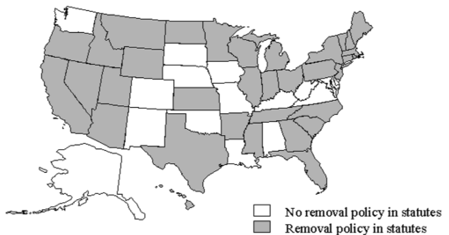
Fig. 2. Summary of state statutes dealing with dam removal. States with/without explicit mention of dam removal in statutes. Information on statutes was collected from reviews of state codes relevant to dams and waterways, and by contacting cognizant personnel in state agencies responsible for management of dams.